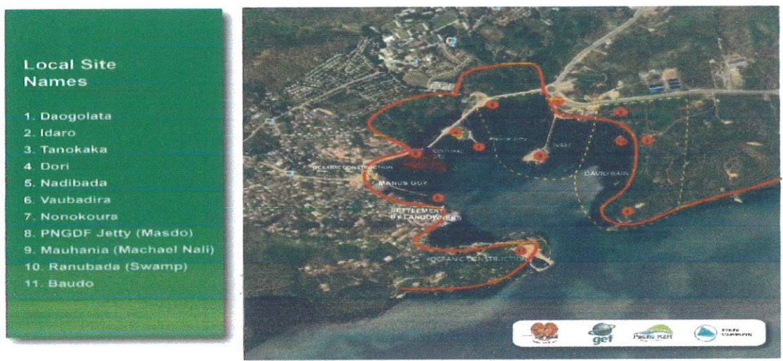
Figure 1: Map of Tuna Bay area reflecting current situation - Settlement and Environment Degradation

The CEPA through support from JICA has initiated a Marine Conservation Area spanning the whole of Bootless Bay and anticipates delivering PNG's first Marine Conservation Area along with the IW R2R Tuna Bay Project.