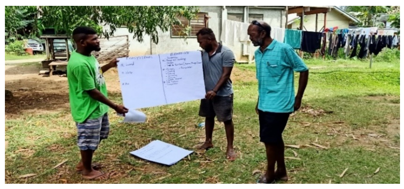
Figure 28: Fijian Quarters and Number 3 Men's group presentation