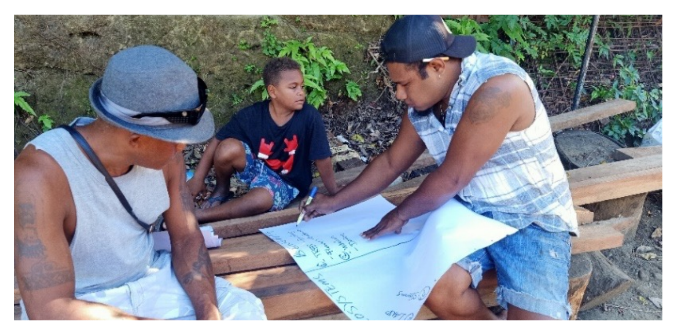
Figure 18: Namoliki and Vara Creek Men's discussion group.