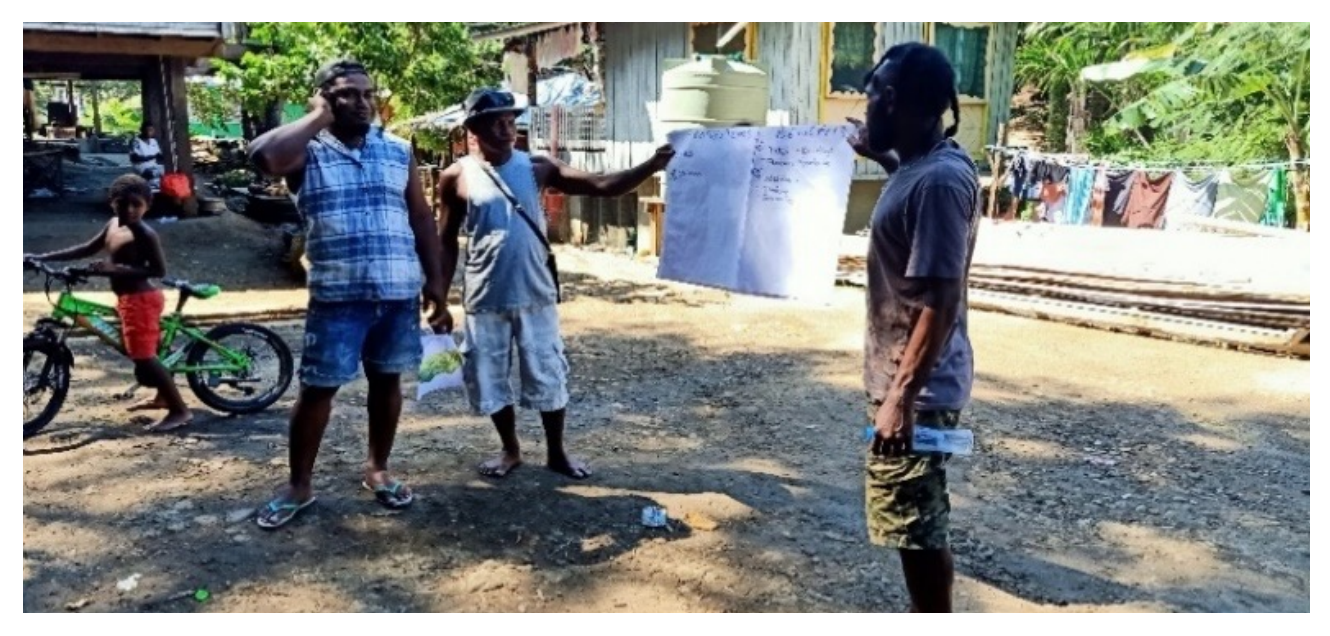
Figure 21: Namoliki and Vara Creek Men's group presentation