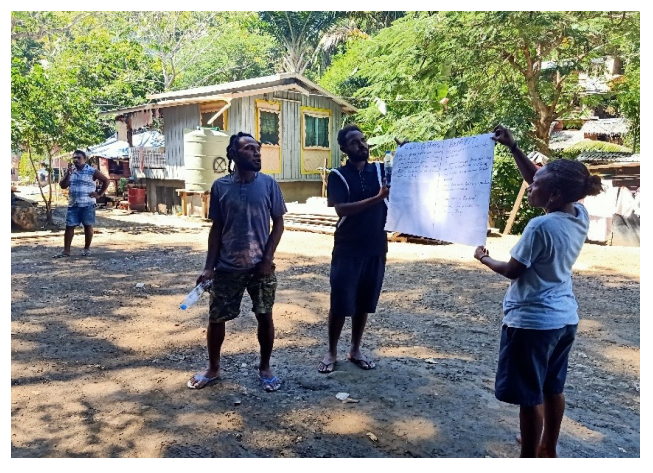
Figure 19: Namoliki and Vara Creek Youth group presentation