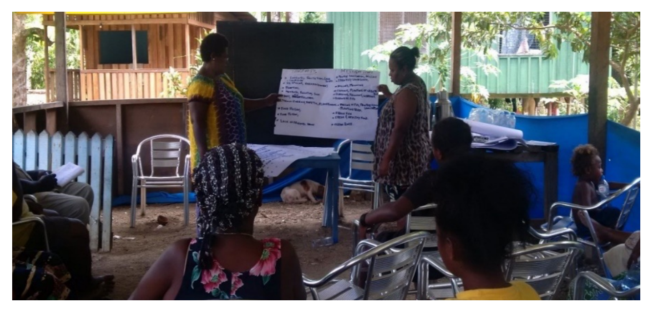
Figure 9: Women's group presentation at Mousona Community