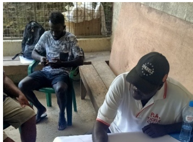
Figure 14: Men's discussion group at Cana Hill