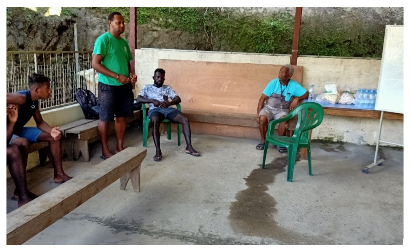
Figure 2: Project Manager gives an overview of the project.

The group discussions were usually very lively because participants were talking about places that they benefitted from or an issue of great concern to them. Some even mentioned things that they have lost because of the current situation and challenges that they have.