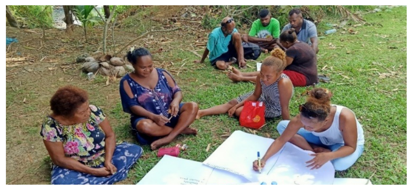
Figure 27: Fijian Quarters and Number 3 women discussion group.