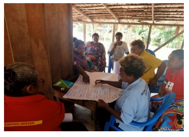
Figure 35: Tuvaruvu Women discussion group.