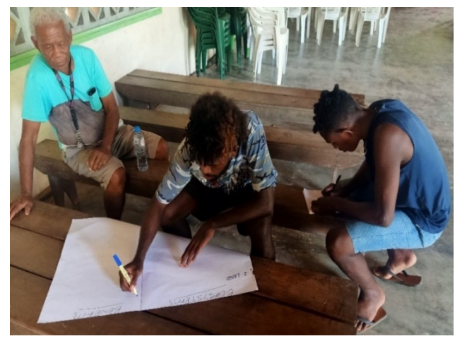
Figure 13: Youth discussion group at Cana Hill.