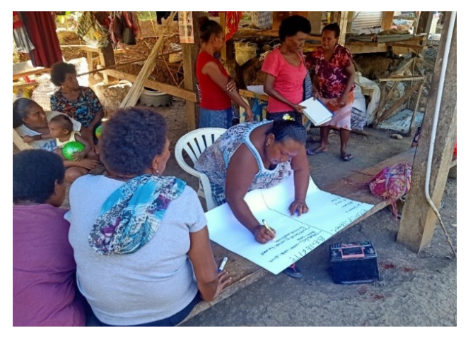
Figure 15: Namoliki and Vara Creek community women's Figure 16: Vara Creek Youth discussion group. discussion group.