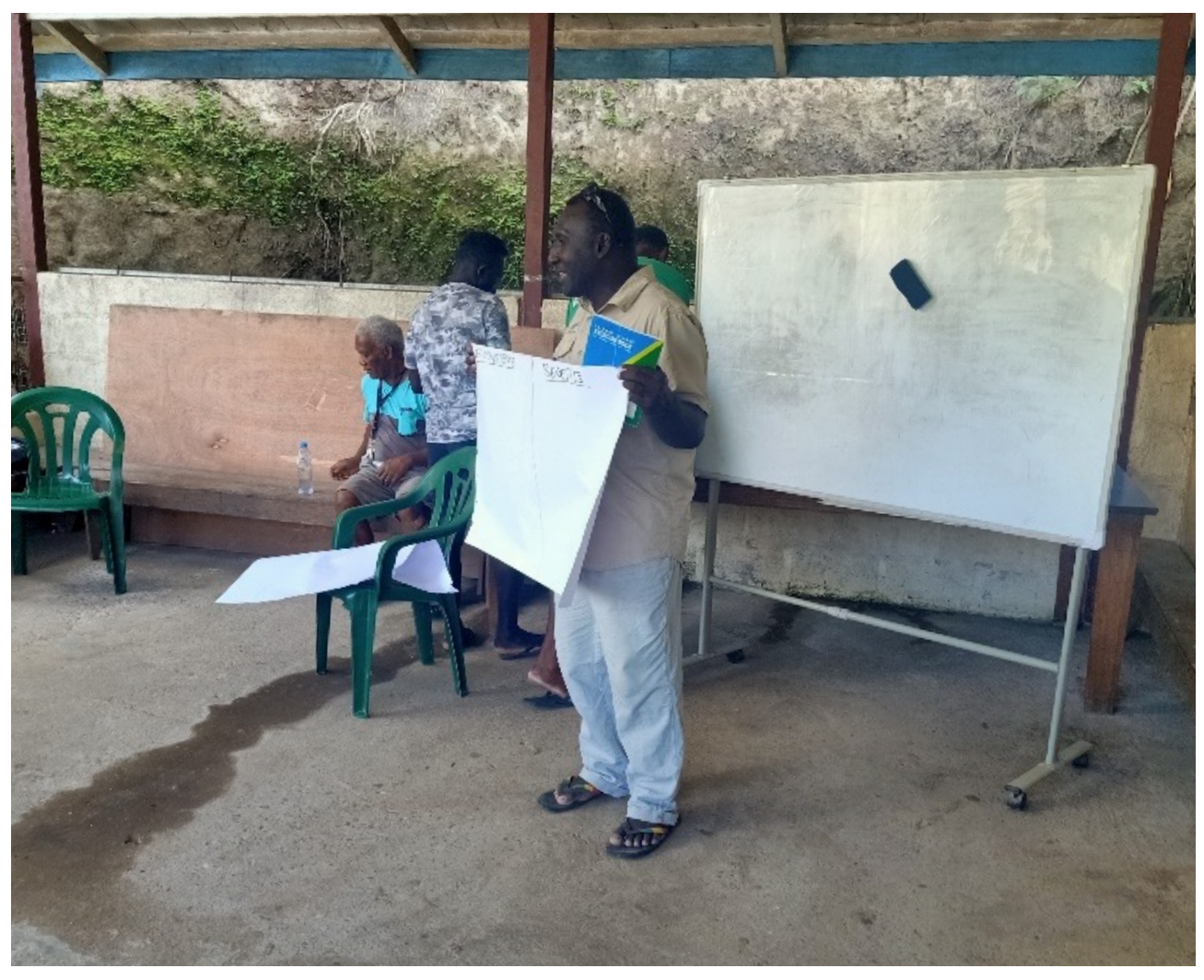
Figure 4: ESSI team team talks about the activities for the consultations