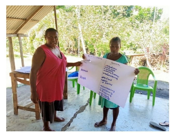
Figure 5: Two women representing Ngalitatae women's group presenting on behalf of their group