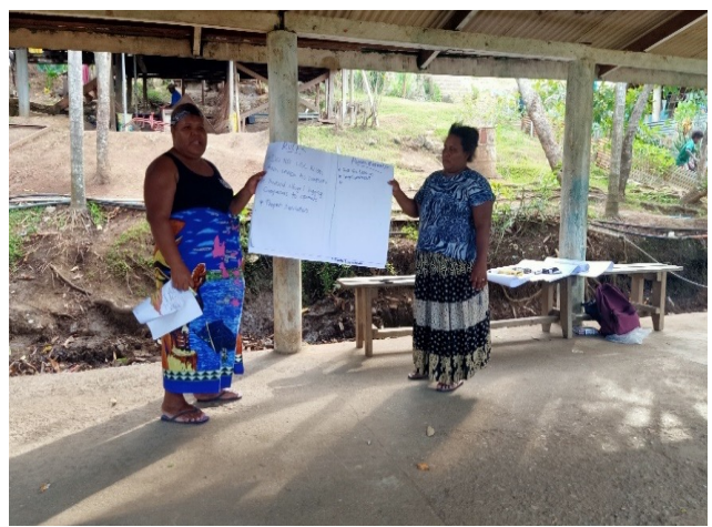
Figure 26: Koa Hill Women's group presentation.