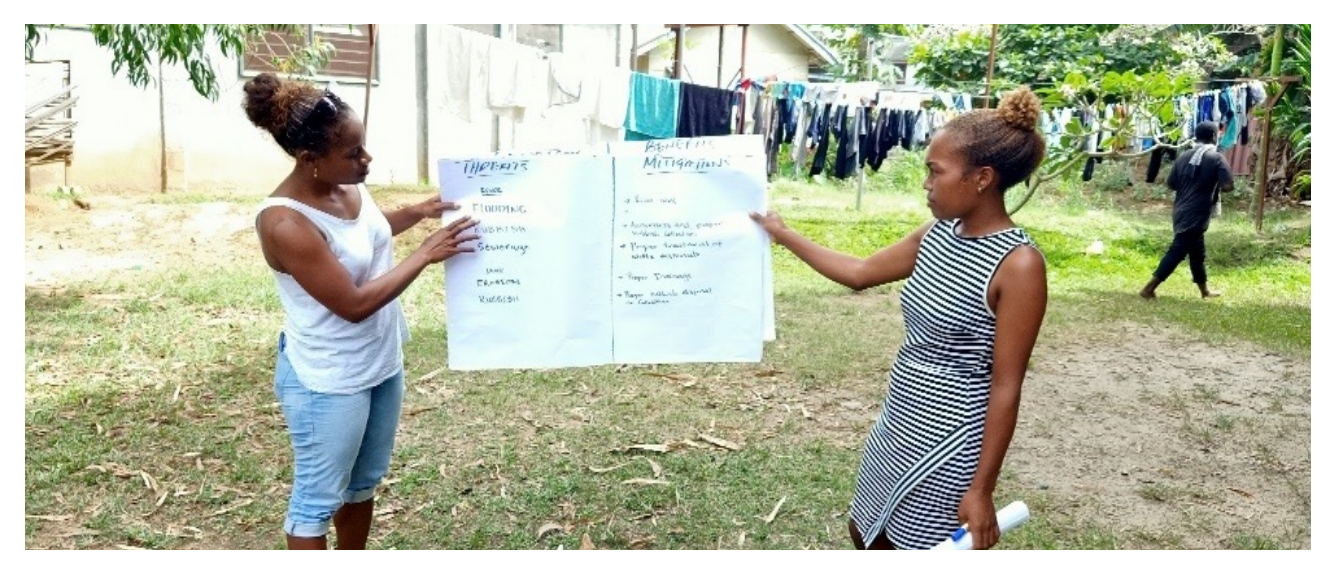
Figure 29: Fijian Quarters and Number 3 community Female youth group presentation