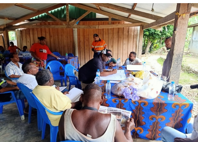
Figure 34: Tuvaruvu Men's discussion group