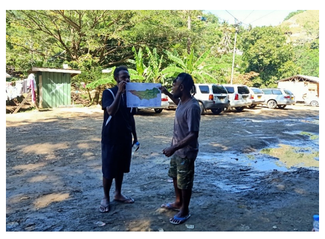
Figure 20: Namoliki and Vara Creek youth group map presentation