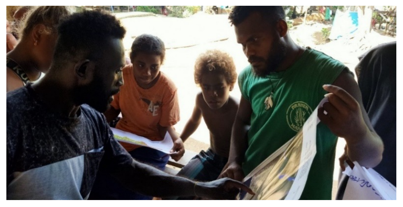
Figure 23: Koa Hill Youth discussion group.