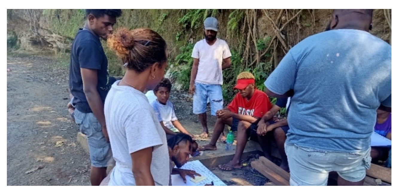
Figure 17: Namoliki and Vara Creek Youth discussion group.