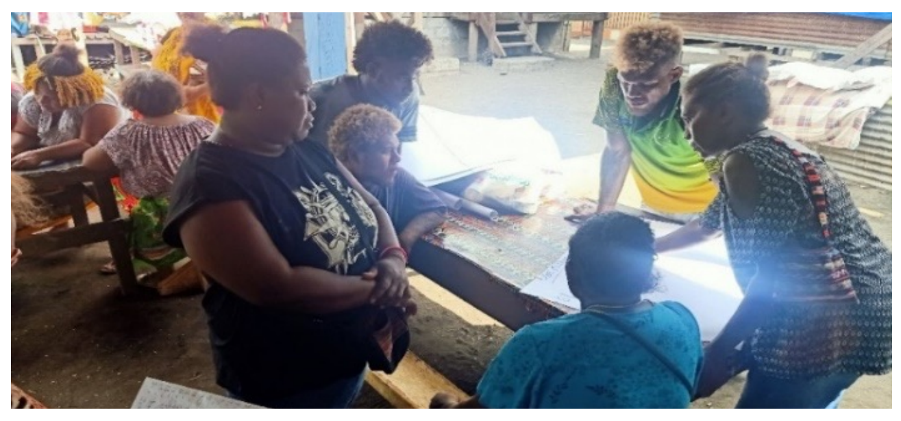
Figure 31: Renlau youth discussion group 2.