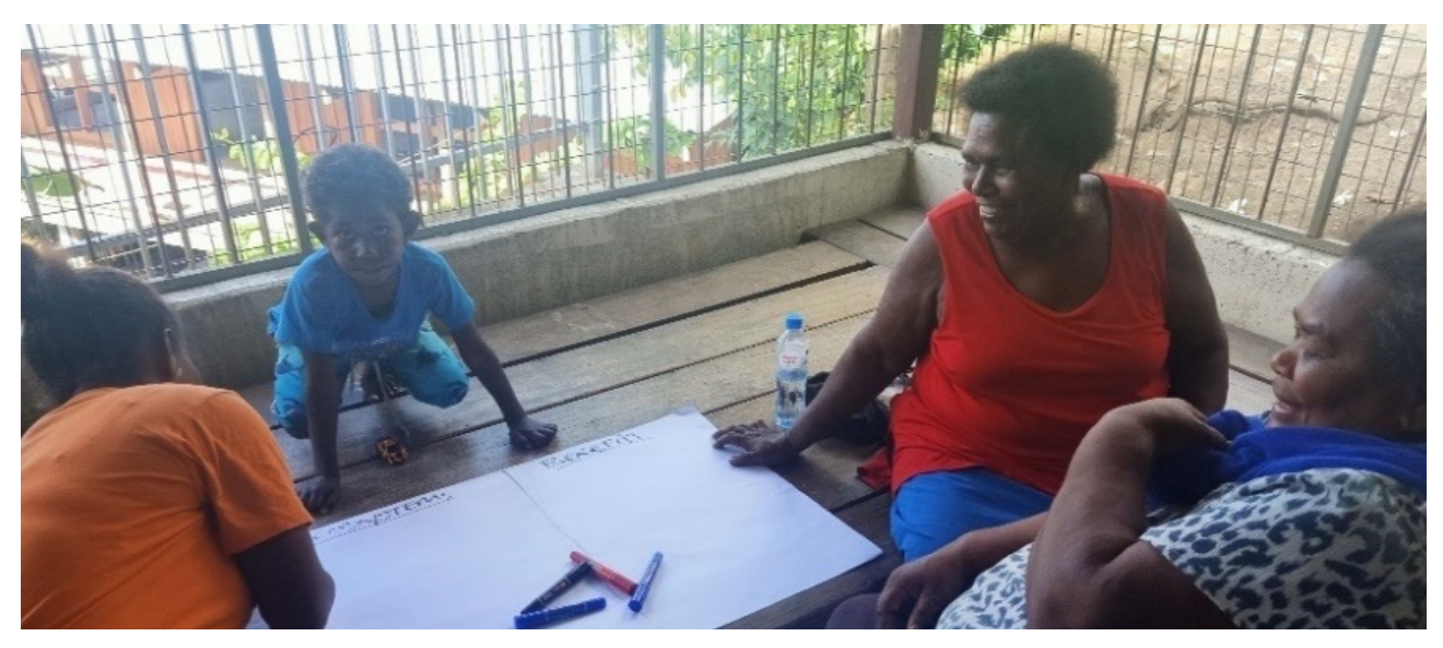
Figure 12: Women's discussion group at Cana Hill