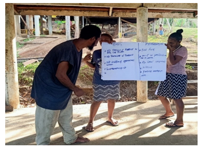
Figure 25: Koa Hill Youth group presentation.