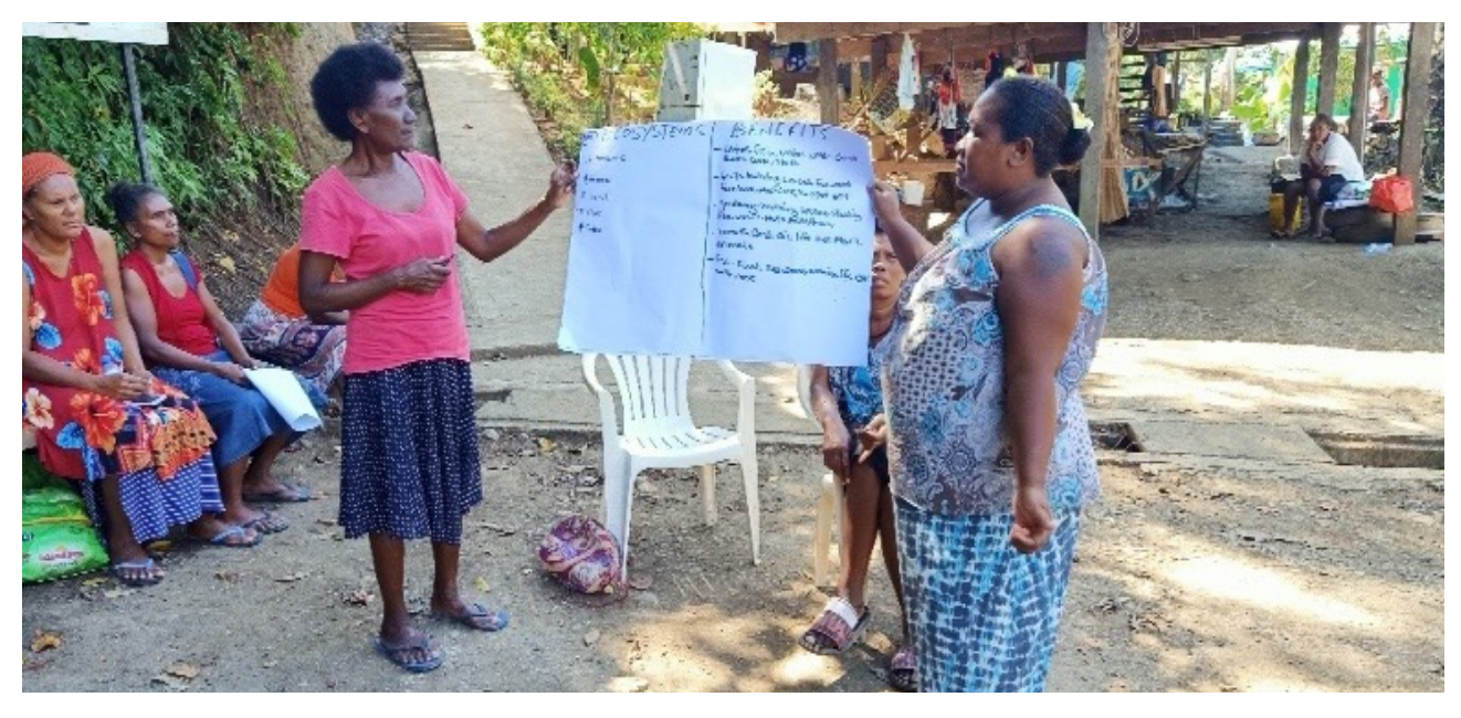
Figure 22: Namoliki and Vara Creek women's group presentation