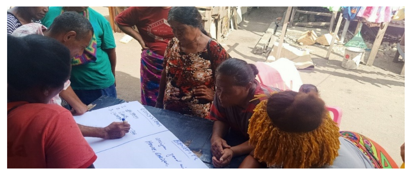
Figure 32: Renlau Women's discussion group.