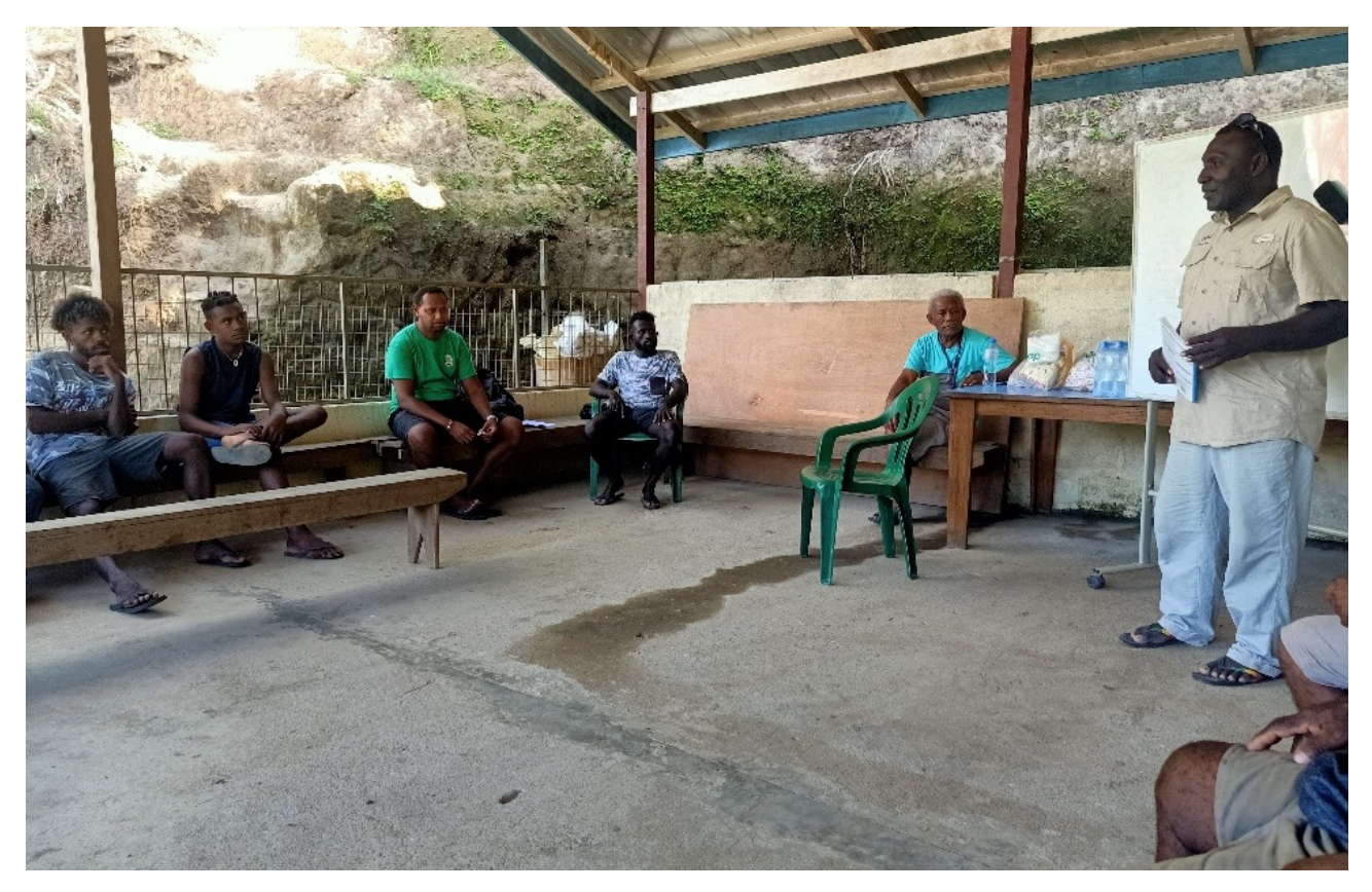
Figure 3: ESSI team leader introduces his team