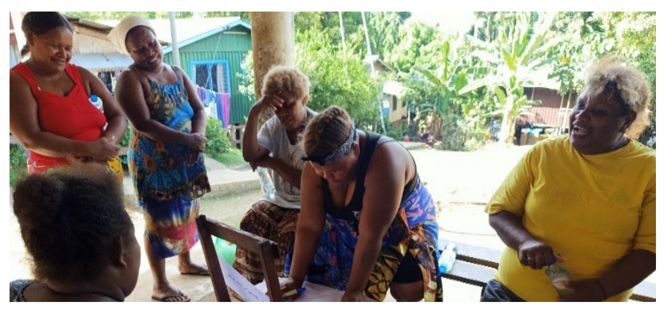
Figure 24: Koa Hill women's discussion group.