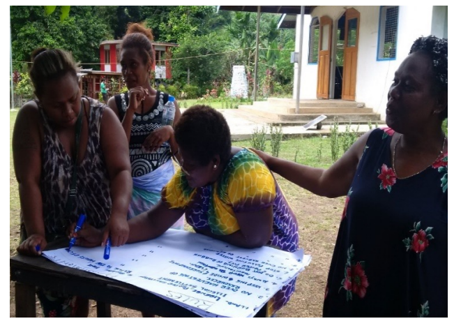
Figure 7: Women's discussion group at Mousona community