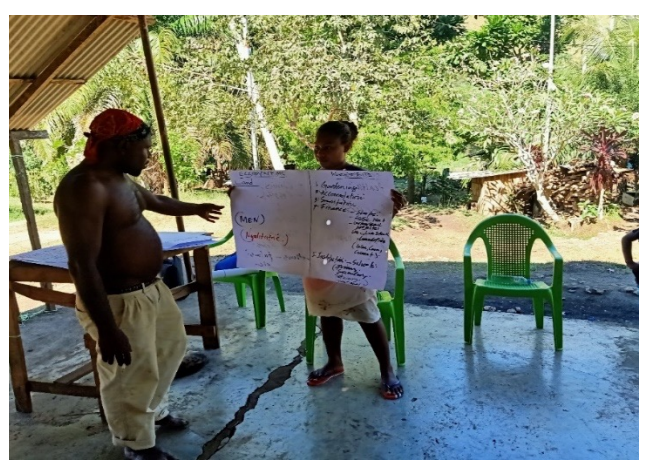
Figure 8: Men's group from Ngalitatae presentation on behalf of their group