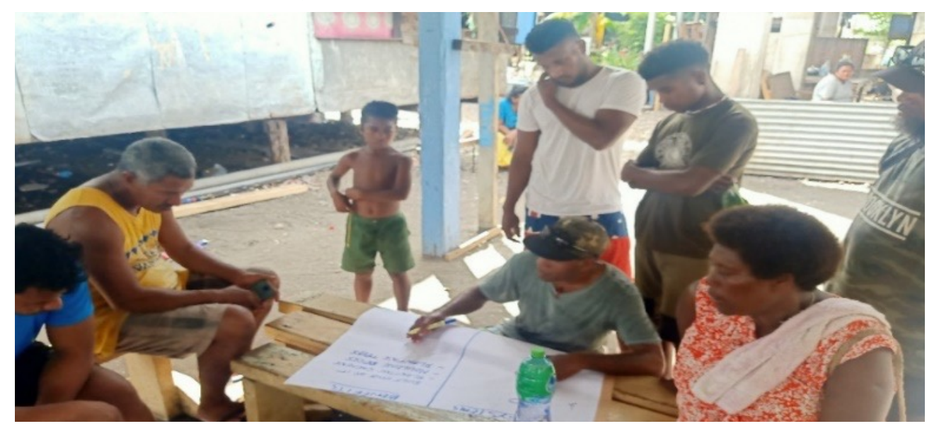
Figure 30: Renlau Youth discussion group 1.