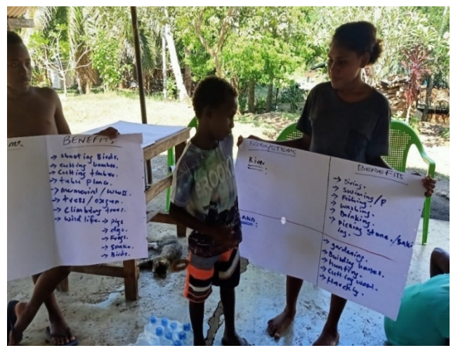
Figure 6: Youth from Ngalitatae present on behalf of their group.