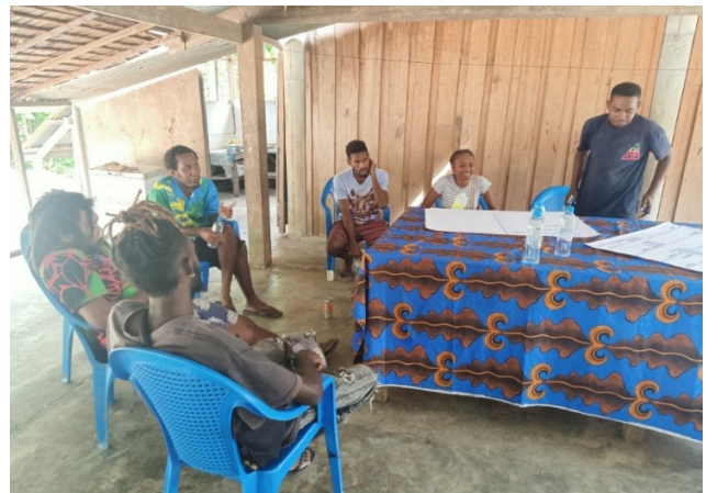
Figure 36: Tuvaruvu and Tanakio youth discussion group.