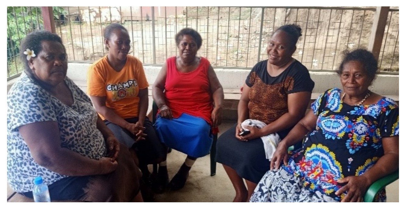
Figure 11: Women participants during Mataniko watershed consultation meeting at Cana Hill SSEC church Hall