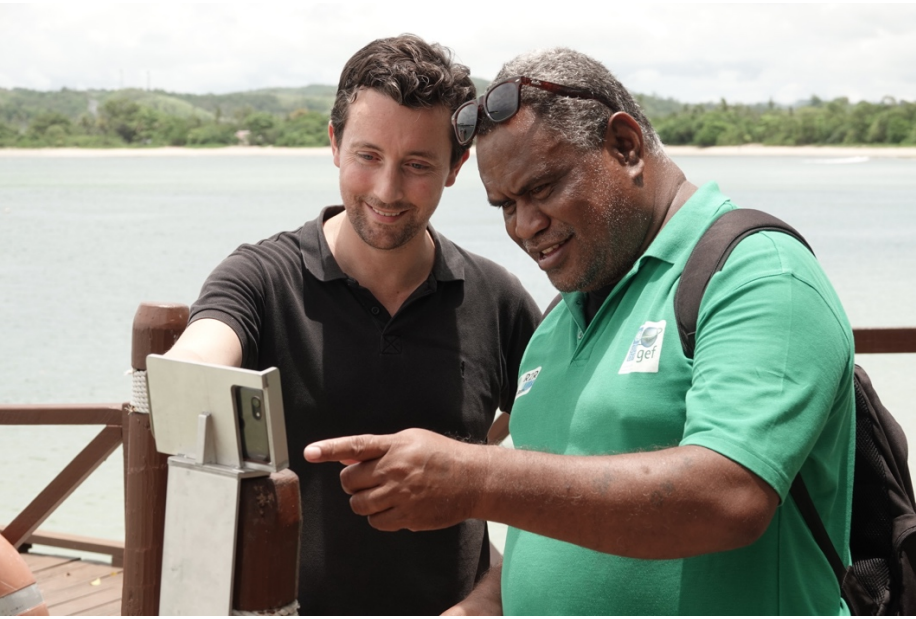
Testing out the installed CoastSnap station.