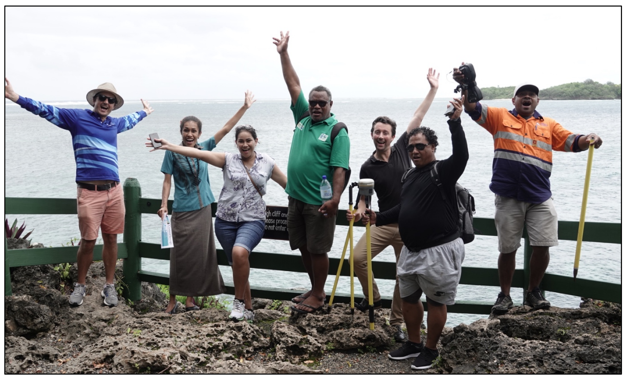
Twinning Workshop participants.

Date: Suva 27 Jan – 31 Jan 2019 Venue: SPC Geoscience Division, 241 Mead Road, Suva, Fiji