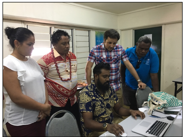
Workshop participants learning how to process data.

The twinning exchange also empowered the Projects to install their own monitoring stations on the return to their home locations with UNSW available for advice and input remotely as needed. Specific considerations for suitable sites were: