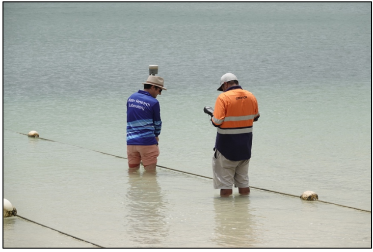
UNSW Water Research Centre and SPC personnel surveying the coastal topography.

help of all participants, the station was installed at the Shangri-La's Fijian Resort on Yanuca Island. The partnership and support of the Shangri-La in embracing it into their impressive community engagement, environmental awareness, ocean monitoring and school education initiatives is of major benefit to the CoastSnap initiative. The workshop trained the participants to plan, install and manage their own monitoring stations on the return to their home locations, with UNSW experts available for advice and input remotely as needed. A Tongan CoastSnap station is looking to be the next implemented through the Tongan Department of Environment.