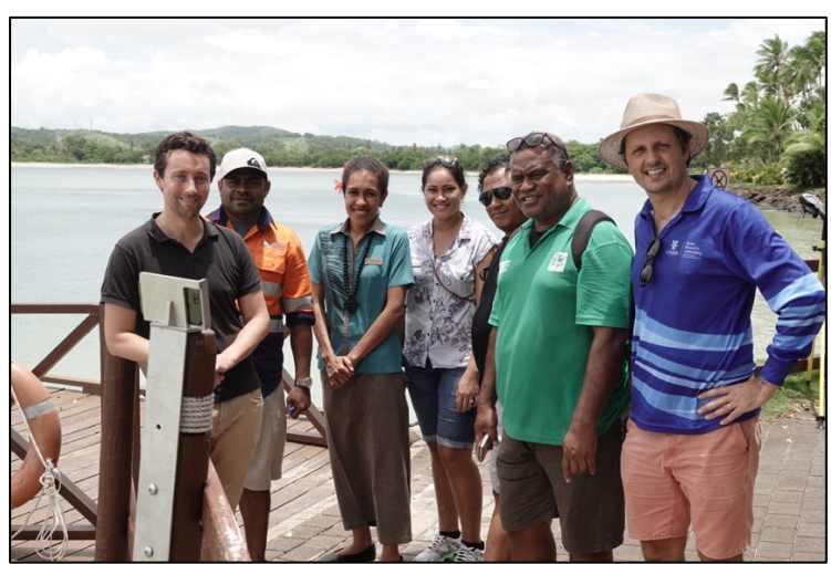
Fiji CoastSnap Station installation complete.

Community engagement – Community engagement and discussion prior to any monitoring effort was stressed. The example of identifying a one female and one male champions from the local community was highlighted based on successful engagement with local communities in Samoa. Facebook statistics available from each community-member upload allow demographic information on who is engaging in the community monitoring to be gathered, such as age and gender.