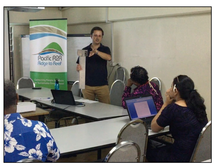
Sharing the CoastSnap concept at the workshop.

The workshop saw participants share the coastal monitoring capabilities and needs from their countries and hear about some of the coastal monitoring approaches pioneered at UNSW. The CoastSnap monitoring approach was the focus of the workshop and the group travelled up the Coral Coast to install the first Pacific Island CoastSnap station. In partnership with the Pacific Community and with the