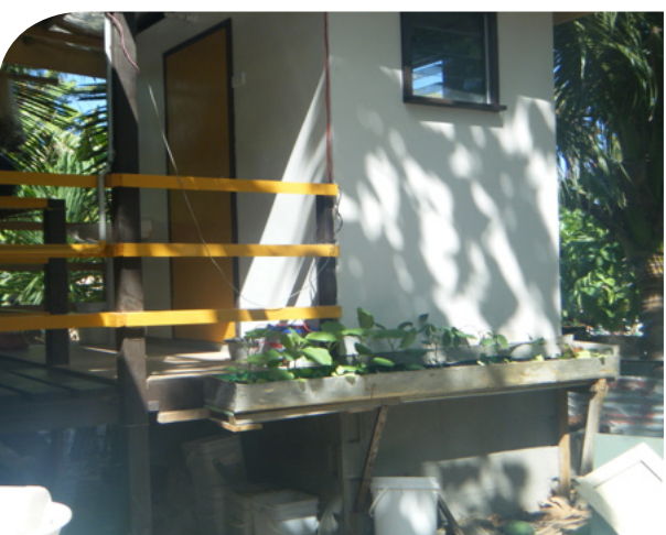
TOP RIGHT: Compost toilet construction training Finished Falevatie