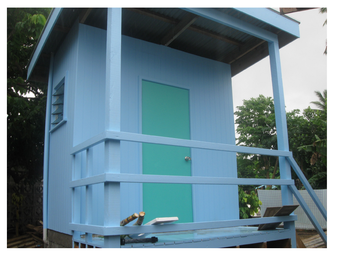
Demonstrated Compost Toilet in Vava'u, Tonga

The investigations of the scenario development have been endorsed by the steering committee and have aided in the development of the Water Resources Management Plan. Implementation of the Water Safety Planning in district level is currently ongoing.