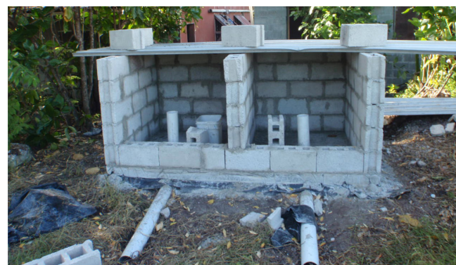
Construction of a household compost toilet. These were made bigger and lower than those in Tuvalu to accommodate the needs of families in Nauru.

Before the implementation of the IWRM project there was nothing about water at the community level and there was nothing about water in the education curriculum. School children never learned about water, its importance, the role of water in the environment or how humans can impact on its quality and quantity.