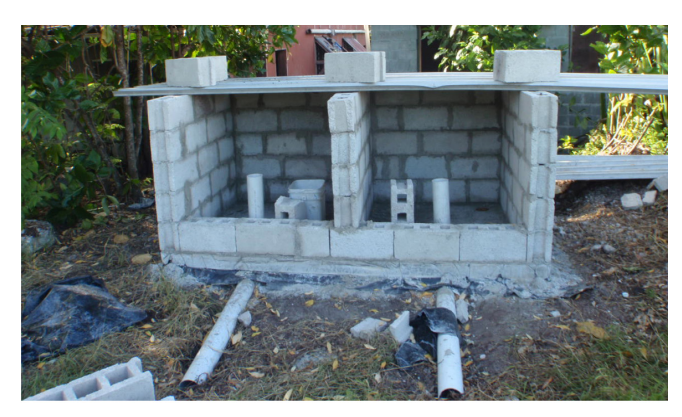
Construction of a household compost toilet. These were made bigger and lower than those in Tuvalu to accommodate the needs of families in Nauru.

We engaged the infant schools, prep to grade one, and wanted to see how they would interpret this new information and how effective it would be. Initially we gave out themes