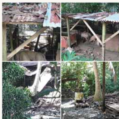
Current Pig Pens used by Kosraean farmers - Pig Pens along the Mutunnena Channel

The significant change is evident not in the water system but in the knowledge and awareness of the people regarding water quality and how to make the water condition much better.