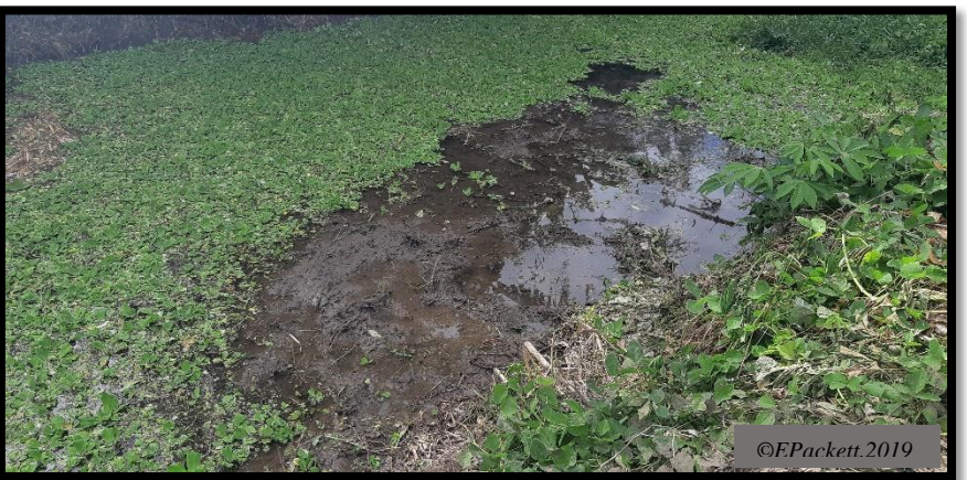
Figure 3 before the removal of invasive species in Tagabe River (WPZ 1)