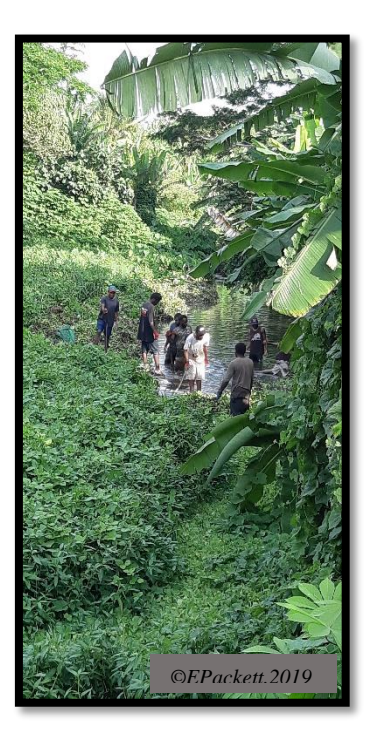
Figure 1 Youth groups and DEPC student intends physically cleaning the river, removing the Water Lettuce (Pistia stratiotes) in Tagabe River Water Protection Zone 1

Hand gloves along with six bush knives (machetes) were distributed for the purpose of clearing out water lilies and a whole heap of Buffalo grass along with few vines from the river bank. In the process of this physical removal, the water lilies were only cleared by the workers using their hands, to gently grab the lilies from the river, and throw the lilies approximately 1 Metre away from the river bank.