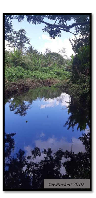
Figure 4 After the Clearing and Removal of Invasive Species in Tagabe River at WPZ 1