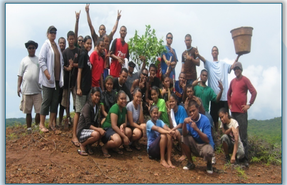
Palau High School students after planting native species to reduce erosion and sedimentation

During the project inception phase a baseline survey on existing and possible pollutant sources was conducted. In addition, the projects goal was to mitigate the impacts of runoffs and sedimentation from the compact road. Regular monitoring of different land uses in Ngerikiil has enabled identification of pollutant sources which have been remediated leading to overall pollutant load entering the Ngerikiil Watershed and near-shore waters and reefs.