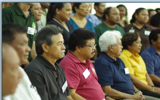
Senators and other participants at the Palau National Water Summit, March 2011