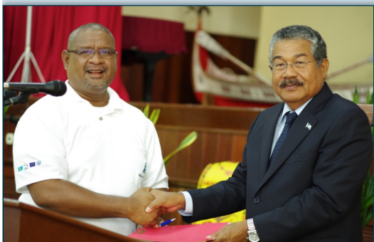
His Excellency President Johnson Toribiong handing over Presidential Proclamation declaring March 22 nd , National Water Day and March 22 – April 22, Blue Ribbon Month

In addition to drafting the Water Policy, increased multi-sectorial engagement has stimulated the need for the establishment of a National Apex Water Body that had not even been considered prior to the work of this project. Sector representatives are now actively engaged on formulating this body including drafting Terms of Reference and list of members.