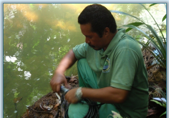
Hydrological testing in support of IWRM project