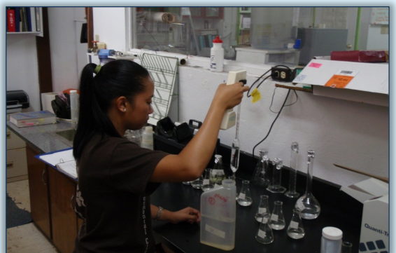
Water quality testing in support of IWRM project

Through engagement in Palau IWRM, a fish farmer operating in the Ngerikiil watershed has put in place an adequate buffer between the aquaculture ponds and Ngerikiil River. IWRM is coordinating routine water quality monitoring to ensure farm effluent does not impact water quality.