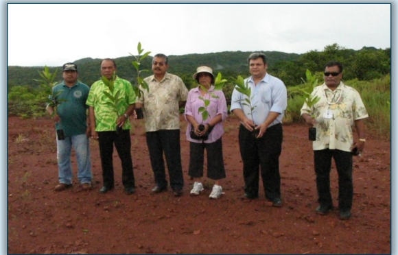
Micronesia's Presidents with EQPB Board Chairman and Airai State Governor tree planting during the Micronesian Chief Executive Summit, 2011