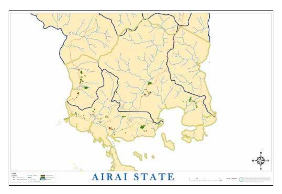
Figure 7: Map indentifying agricultural areas in Airai State.