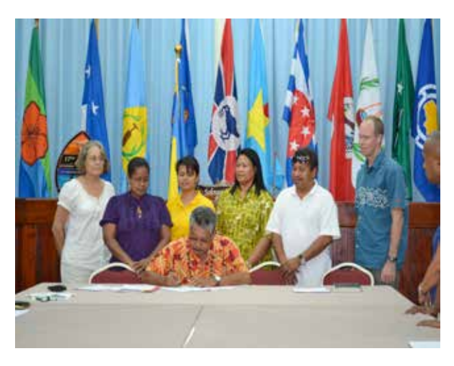
Figure 3: His Excellency President Johnson Toribiong endorsing the Palau National Water Policy