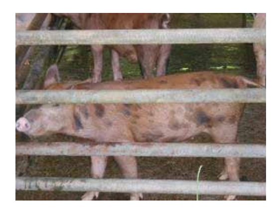
Figure 15 IWRM supported a piggery located in Ngerikiil to put in place an adequate buffer between pig pens and river and improved water cistern. Efforts are also being made to trial dry-litter composting of pig waste rather than standard wash down systems that use a lot of freshwater and generate wastewater (4 November 2011)

At the time of project start-up there was little if any work that concentrated at keeping the quality of water high even before it arrived at the water treatment plant. The target of the project is to increase access to safe drinking water by 90 percent of the population in Koror which is ~ 14,000 people. The IWRM project has undertaken a baseline sanitation and pollutant survey at the Ngerikiil River covering ridge to the Airai Bay. All pollutant sources and land uses along these river banks were mapped and those that could potentially become problems are helped with best management practices as a preemptive measure. Routine monitoring of river water quality has been strengthened through the project to ensure safety baselines are met and to inform efforts to remediate pollutant source sites. In addition, increased outreach to areas that are more reliant on rainwater has allowed us to increase awareness of how to maintain rainwater catchment systems thereby providing a safe drinking water supply.