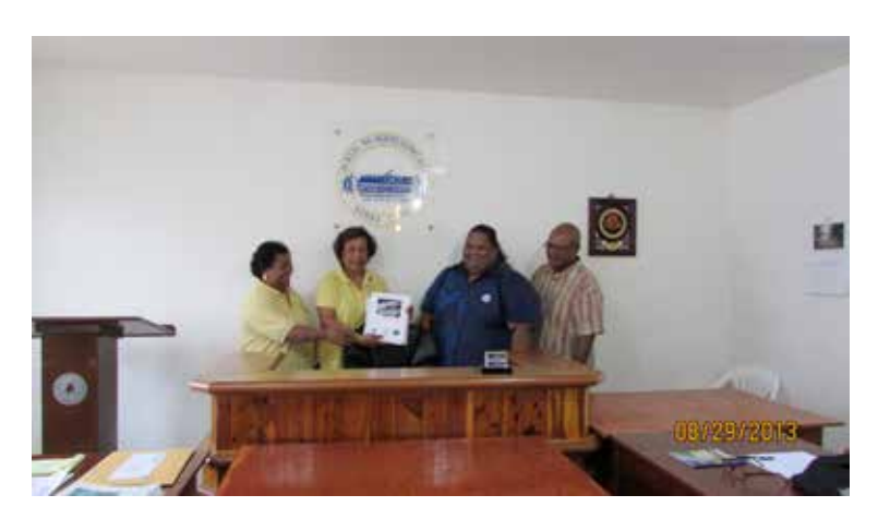
Figure 6: Handover of the Airai State Watershed Management plan enabling the Airai State Government to access funding for Management, monitoring and enforcement of best management practices in the Watershed.