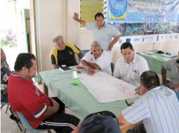
Figures 2 & 3: Gender Mainstreaming in developing Village Waters Management Plan