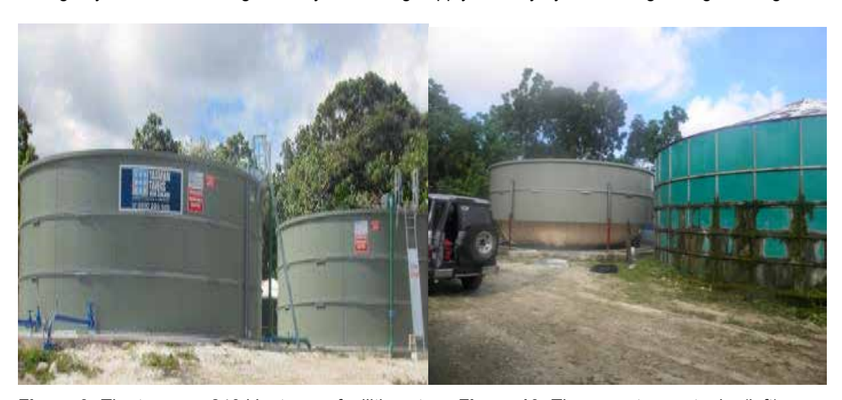
Figure 9: The two new 240 kL storage facilities at Alofi South

The project has seen the replacement of the existing tank with two new 240 m<sup>3</sup> storages, increasing storage by over 45% and significantly increasing supply security by eliminating storage leakage losses.