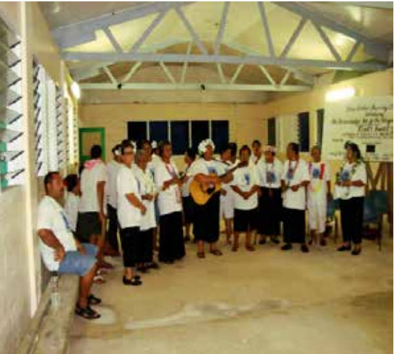
Figures 4 & 5: Launching of the Alofi South Village Water Management Plan