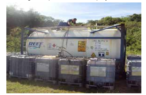
Figure 8: Waste Oil transfer for transport

Recommendations will be made within the draft to identify a regular funding mechanism for future management and disposal of waste oil. The IWRM project is working with the GEF PAS project on options and will continue to take the lead.