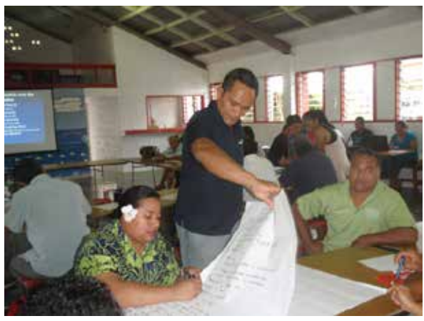
Figure 12: Implementation of Village Water Management Plans