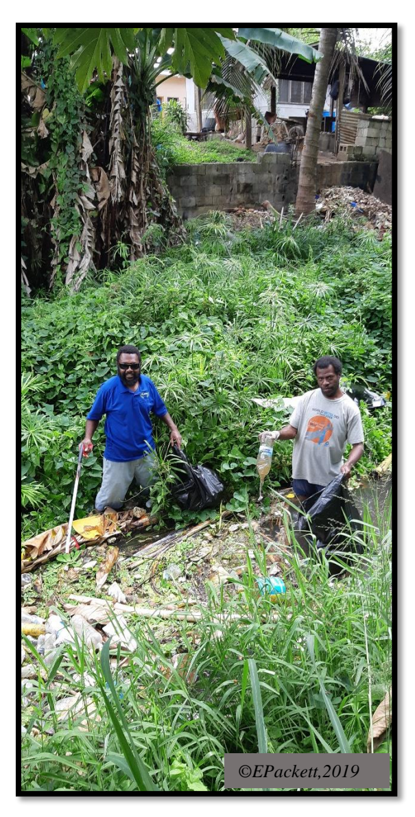
Figure 4 Department of Environmental Protection and Conservation Staffs engaged in clean-up campaign along Tagabe

It has also come to attention that the communities take pride in their participation in this campaign. Thus showing their concern for the river from which they are the direct users and beneficiaries. If the river system is not healthy through solid and liquid waste contamination which, then it becomes polluted. With daily access to the river, this should be seen as a potential health risk to communities as well as freshwater biodiversity. These was communicated clearly to all resident communities along Tagabe River during the mass awareness campaign that was schedule through this year. As such this had played a major impact and influence back to the communities to take very serious consideration on how they manage the river. Again this clean-up campaign, especially the engagement of communities