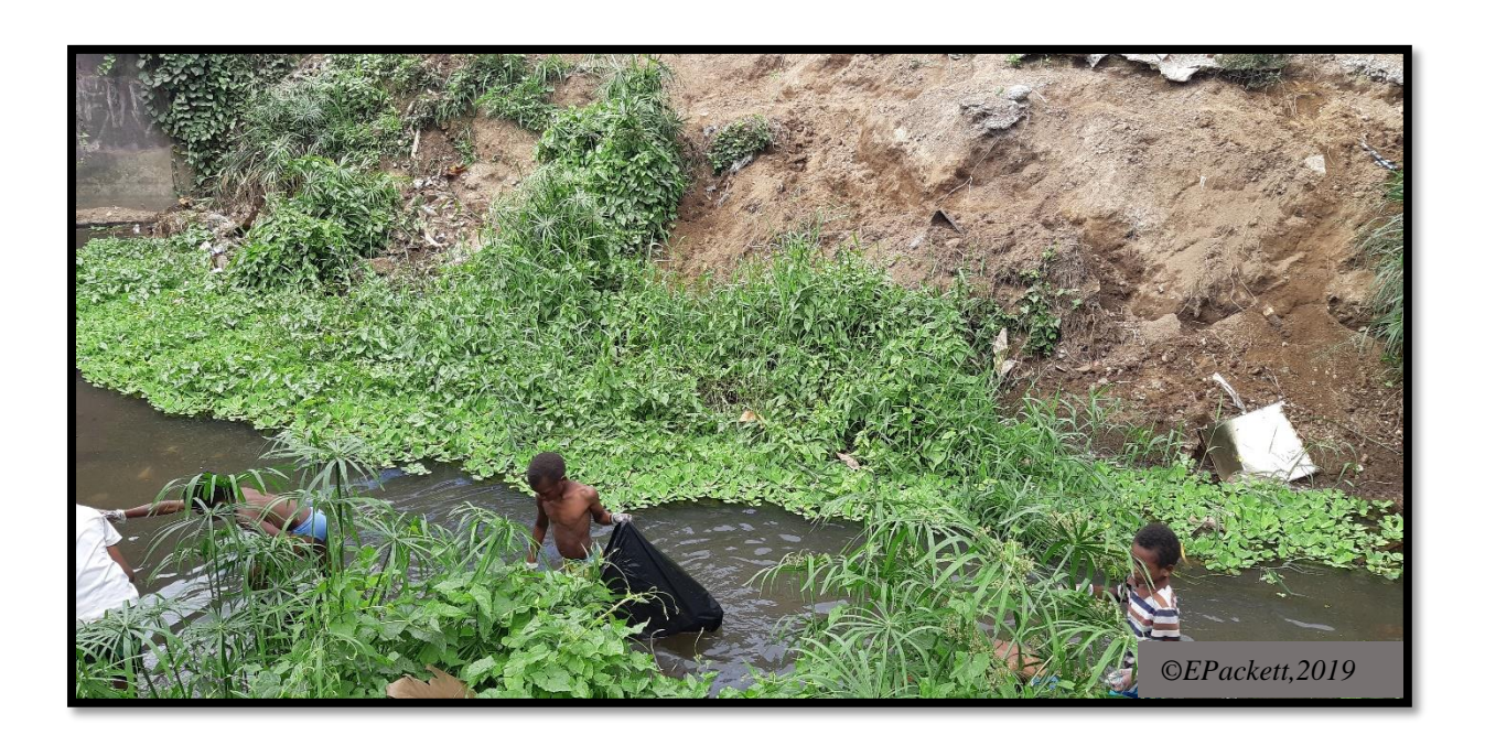
Figure 3 Tagabe main bridge children participate in river clean-up campaign

The Department of Environmental Protection and Conservation as one of the main government institutions dealing with waste management were also part of the engagement. It was a good initiative for the communities to have DEPC team there, on-ground showing their commitment from what their have been advocating in related to waste management. IMM has representation of one the active NGOs around Tagabe and Blacksand area are part of this campaign, mobilizing communities and ensure the overall implementation of this activities.