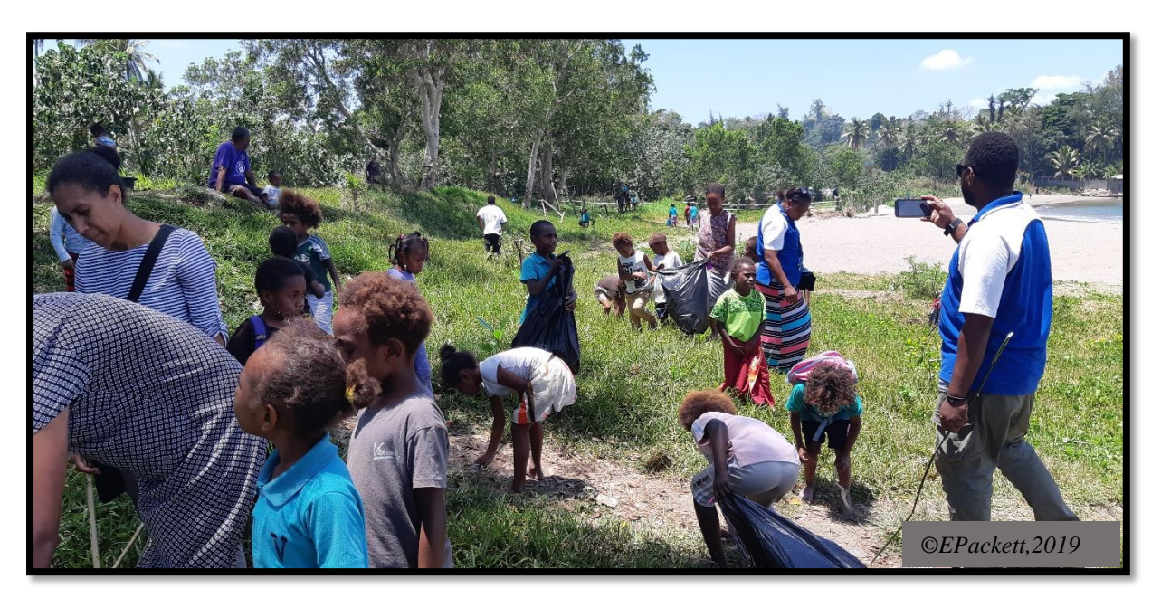
Figure 6 Victory Hope Primary School Engaged in Coastal Clean-Up Campaign along Blacksand Shoreline

Coastal clean-up campaign follows the awareness with the school and then tree planting with both the School and the communities. Department of Forestry through the IW R2R Project collected 636 coastal trees which were then planted along the Blacksand Beach with an aim to restore coastal vegetation and improve resilient to coastal erosion. A total of 600 trees were planted with much enthusiasm from both communities and the school.