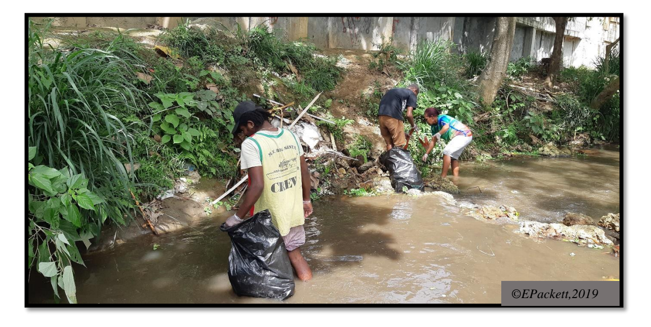
Figure 2 Shefa Youth engaged with the Tagabe Community in River Clean-Up Campaign

It was clear enough that community members are concerned about their river and this shown by the effective participation. Majority of which are women, young girls, children, men and elderly people. Each islander chiefs/leaders were responsible to coordinate his/her community to participate in this mass clean up. During the preparation of this cleaning campaign, chiefs were notified and in advance with notices posted in every community notice boards. Therefore the communities were well aware of this activity. The community's turn out for the river clean-up reflects their concern and ownership roles to protect Tagabe River for the purpose sustainable livelihood and sustainable river that is free from liquid and solid waste pollution.