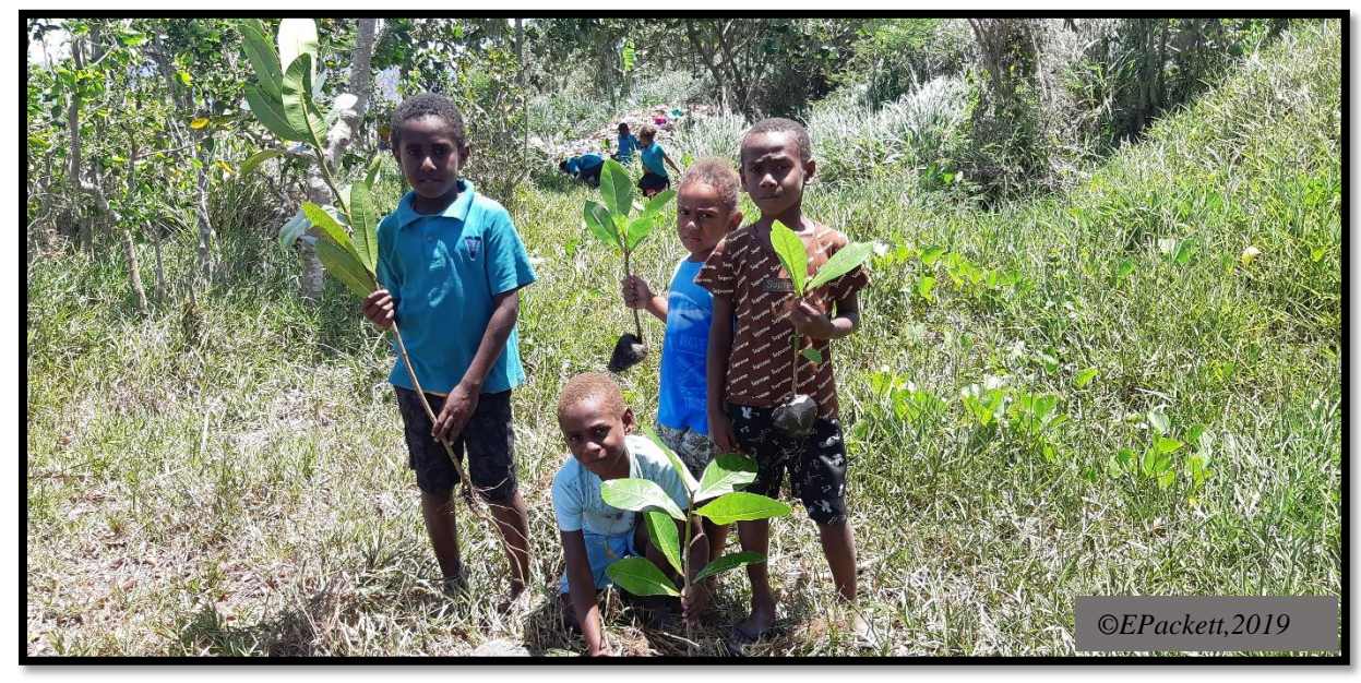
Figure 7 Victory Hope Primary School also involved in tree planting along Blacksand coastal areas to restore coastal forests