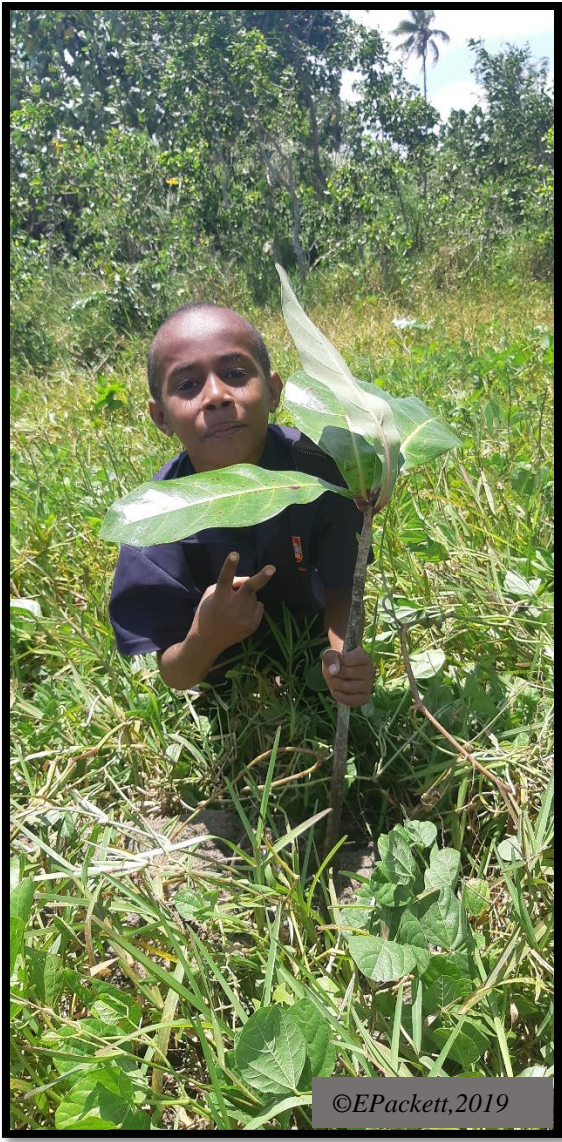
Figure 8 Victory Hope student enthusiastically plant each tree in marking their effort and concern to restore coastal forest of Blacksand shoreline.