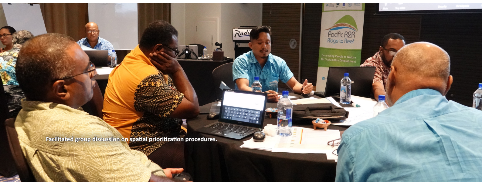
Facilitated group discussion on spatial prioritization procedures.