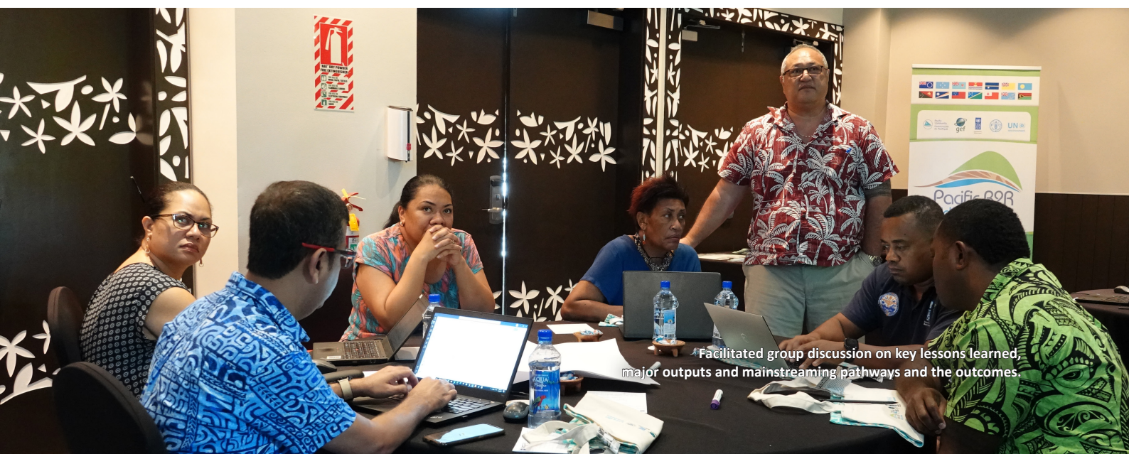
Facilitated group discussion on key lessons learned, major outputs and mainstreaming pathways and the outcomes