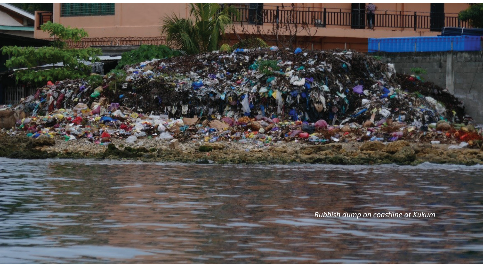
Rubbish dump on coastline at Kukum

According to the Mataniko Environment Baseline Report (2018), it depicts that majority of wastes were mainly solid waste due to unsatisfactory disposal methods and approaches. The study does not capture organic waste from decaying leaves assuming that land use activities at the upper catchment including subsistence farming might exacerbate their occurrence.