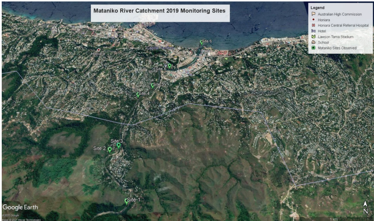
Figure 1 shows the sites observed and sampled in 2019 by the MECDM

Figure 1 clearly depicts the sites observed and sampled by MECDM in 2019 and need to continue monitoring annually. Trends of improvements or worsening help inform policy decisions on the impact of policy interventions particularly those set out in the Mataniko Integrated Management Plan. The consistency of using the same sites provide for more useful comparison spatio-temporally.