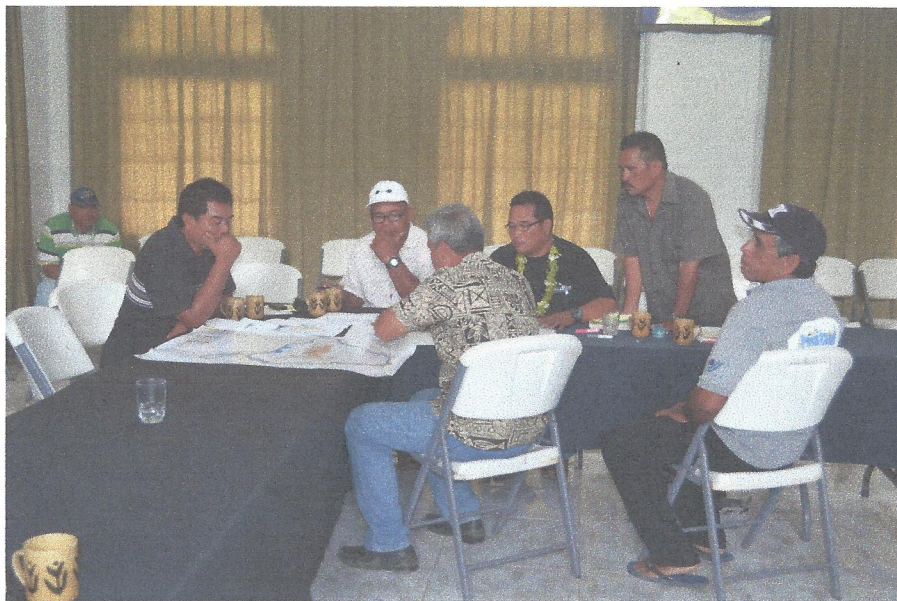
Mayors and community representative from Faichuk sharing ideas to guide their mapping of region-wide management and protection areas

Participants concluded their first day with the bid group analysis on current status of the reefs in Chuuk. This was done based on published surveys and other long-term coral reef monitoring as part of the Micronesia Challenge. Participants compared this region based reports with what they are seeing on their own reefs. And they had to determine whether or not there is need for protection intervention for their resources and food supply. Virtually, everyone agreed that Chuuk fish supply is diminishing is population and biomass and that there is need to do something about it.