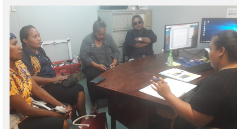
Preparation for talk show

Follow us on Facebook Nauru Ridge to Reef and Twitter (@R2RNauru) or email us on r2rprojectnrucomms@gmail.com PH: 557 2960