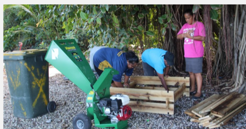
Assembling compost pit