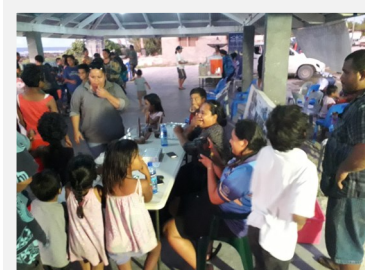
NUC stall at Anetan