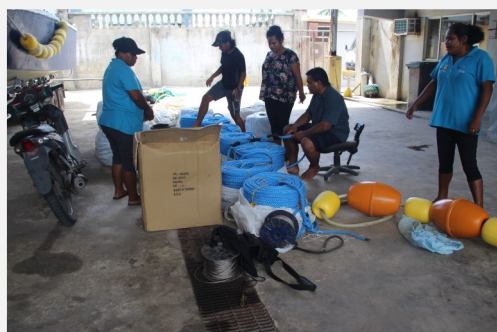
TSO with NFMRA working on FAD