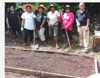
Establishing kitchen garden Anibare