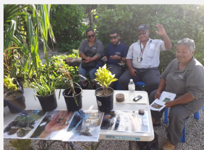
Canstruct stall at Anetan