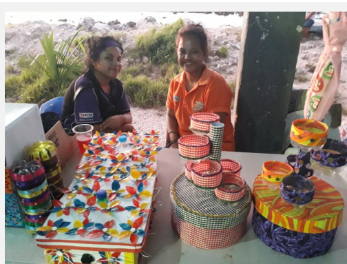
NRC Stall at Anetan