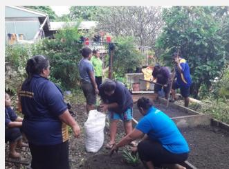
Kitchen garden in Anabar