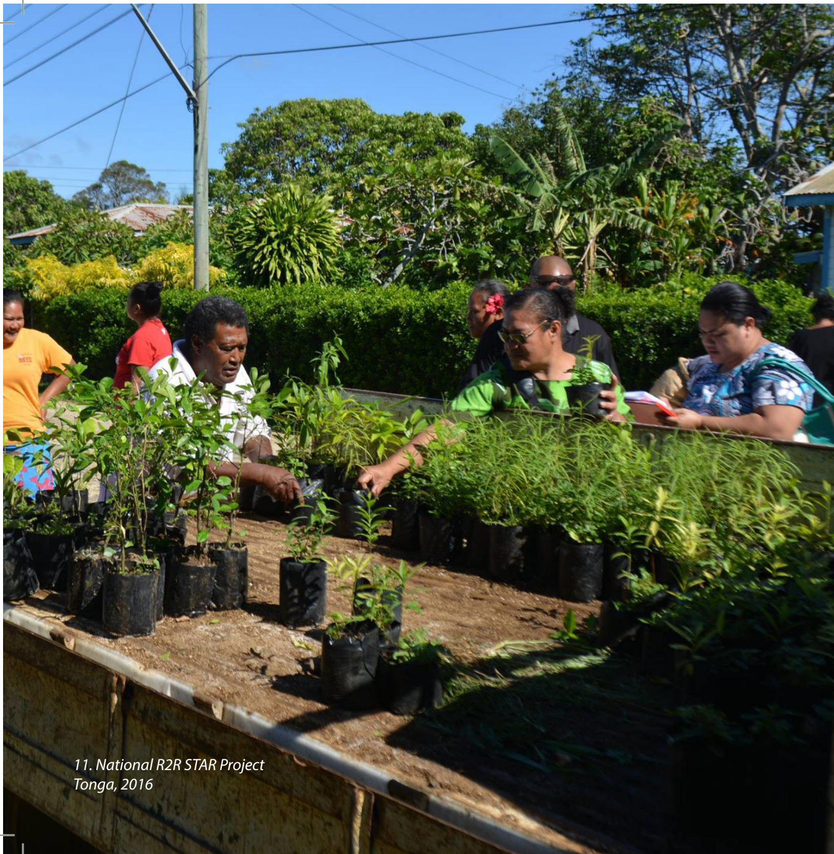
11. National R2R STAR Project Tonga, 2016