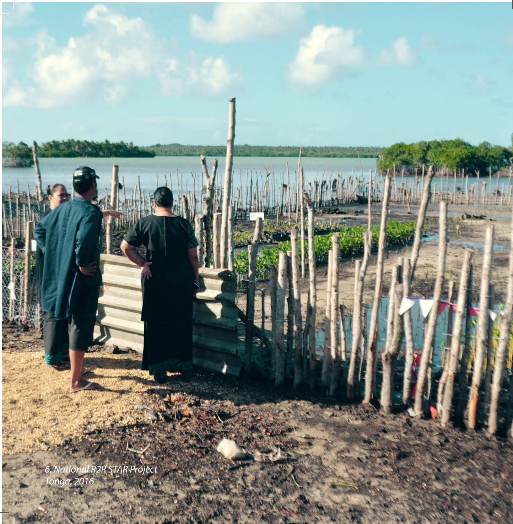
6. National R2R STAR Project Tonga, 2016