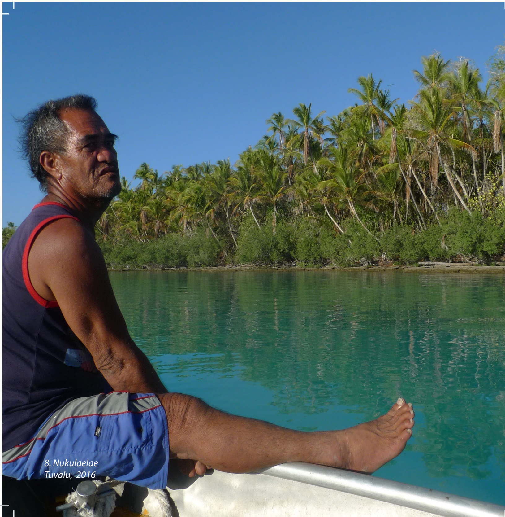
8. Nukulaelae Tuvalu, 2016