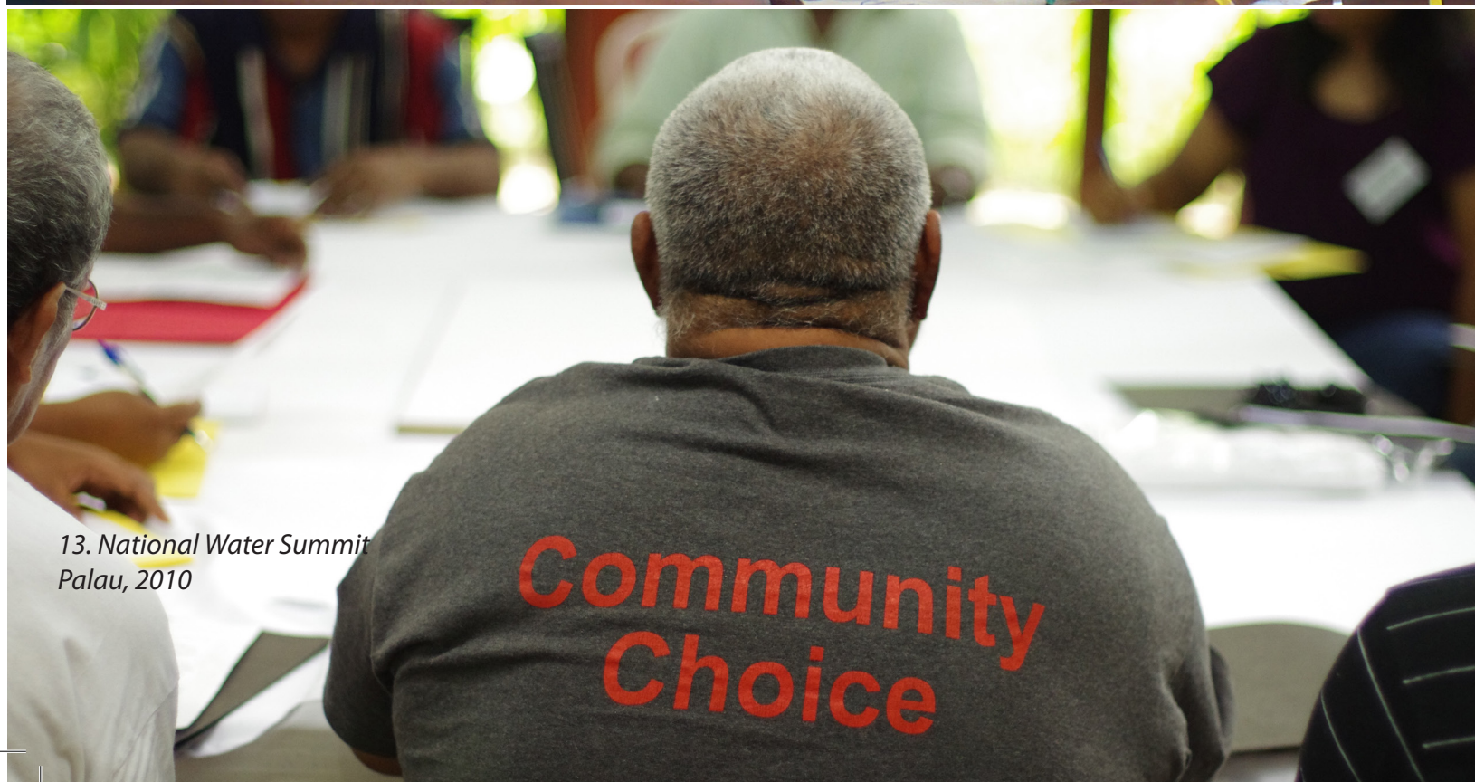
13. National Water Summit Palau, 2010