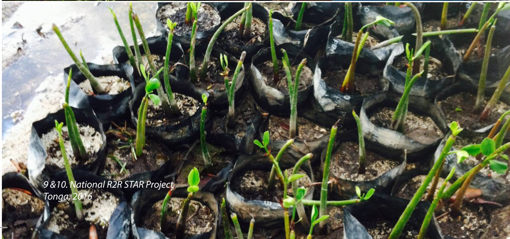
9 & 10. National R2R STAR Project Tonga, 2016