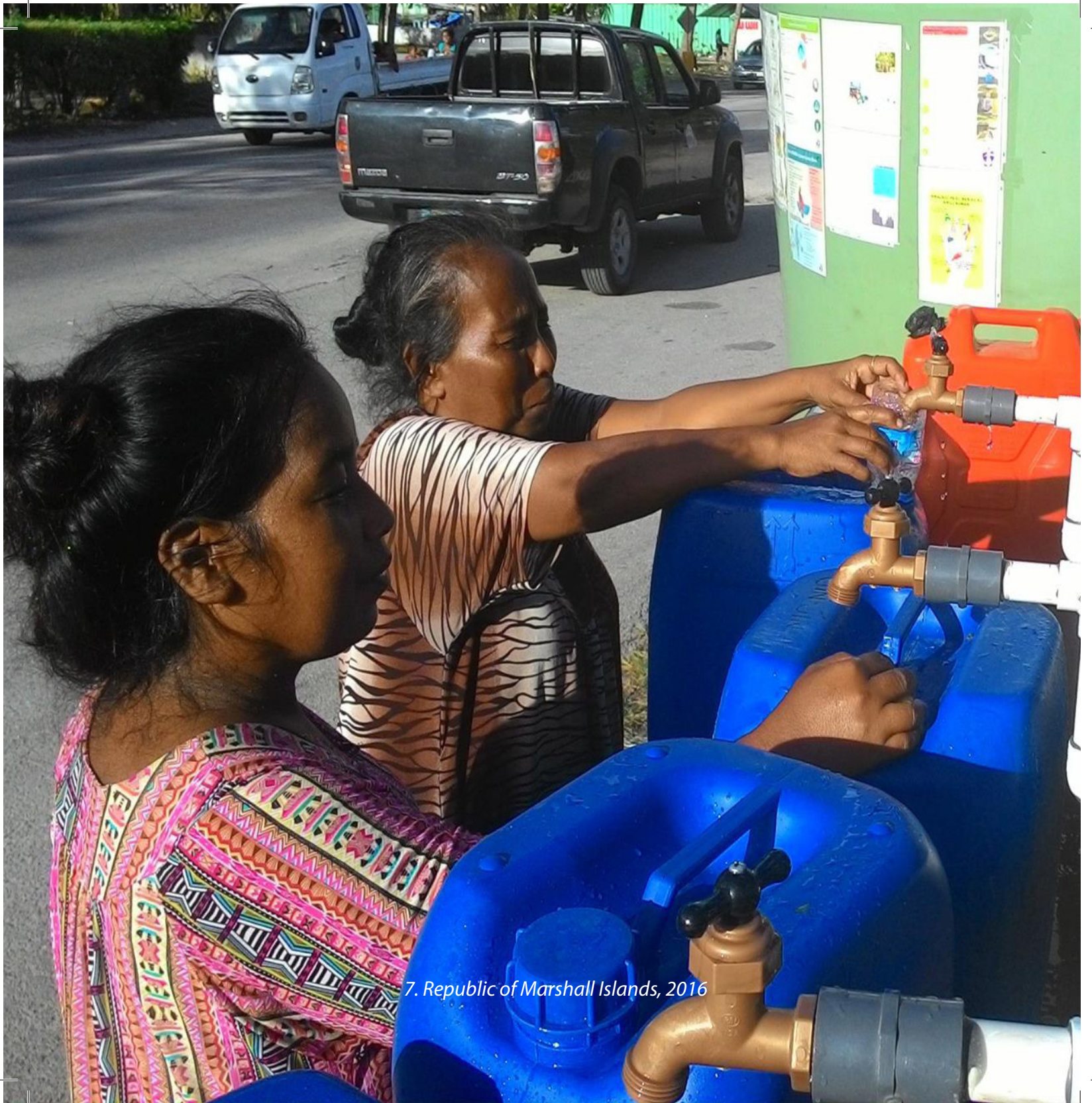
7. Republic of Marshall Islands, 2016