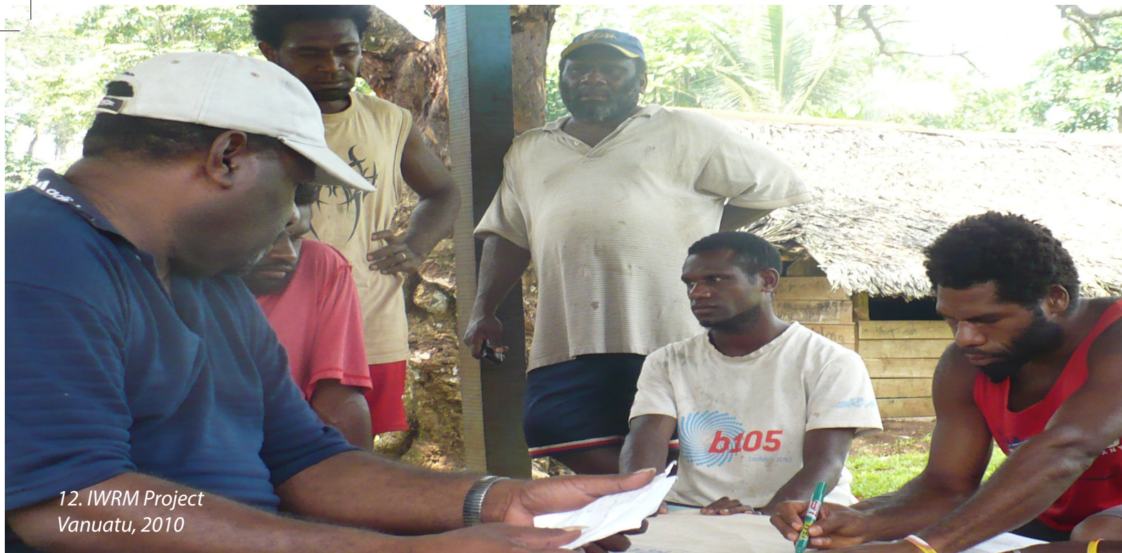
12. IWRM Project Vanuatu, 2010